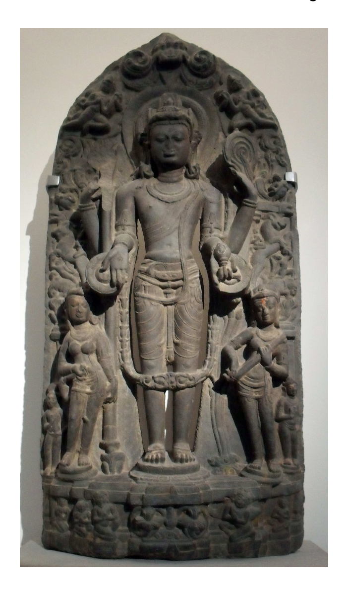
The Sena dynasty

The Sena dynasty was founded in Bengal as the Pala dynasty's power declined at the end of the eleventh century. The Sena dynasty lasted until 1204. The Pala kings had taken control of northern and western Bengal. South-east Bengal remained independent at this time. The Sena kings sought to control all of Bengal. The Sena Empire was founded by Samanta Sena and extended by Vijaya Sena. Vallala Sena is said to have helped to extend the area controlled by the Senas into south-east Bengal. The Senas were more than conquerors. They were scholars and great authors.