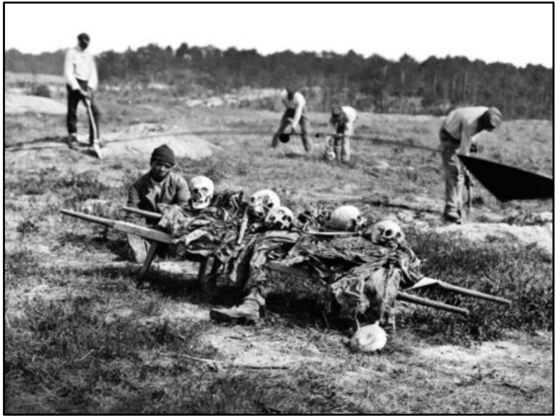
[From https://www.religiousleftlaw.com/2017/05/black-african-concentration-camps-in-the-second-angloboer-war-11-october-1899-31-may-1902.html. Accessed on 17 November 2020.]

This photograph shows the Black African concentration camps in the Second Anglo-Boer War (11 October 1899–1902).