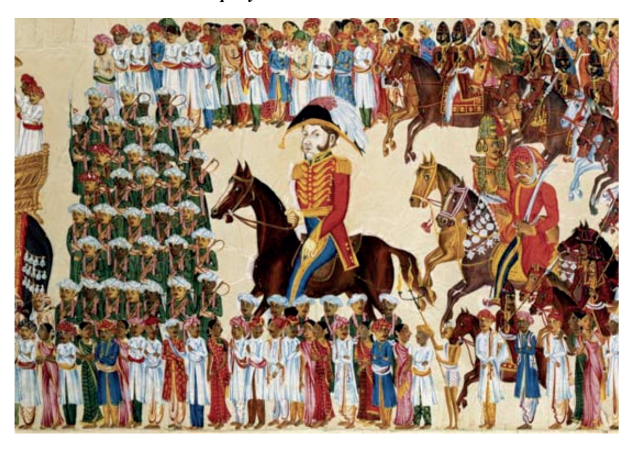
(b) What does Source B tell us about the British East India Company in 1825?[5] (J/2015/Q1b)

Examiner Comments : There were some good answers to Question 1(b) from candidates who were able to use features from the source to make inferences about it. However, a large number of candidates ignored the source completely and wrote generally about the East India Company or provided a description of events and British conquests more suited to 1(c), thereby scoring no marks. Other candidates merely described what they saw in the source without making any inferences and thereby gained few marks.