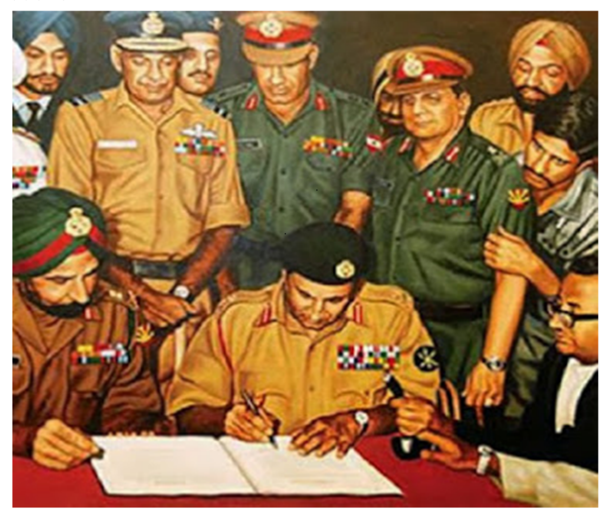
The Signing of a peace treaty by high ranking military officers.