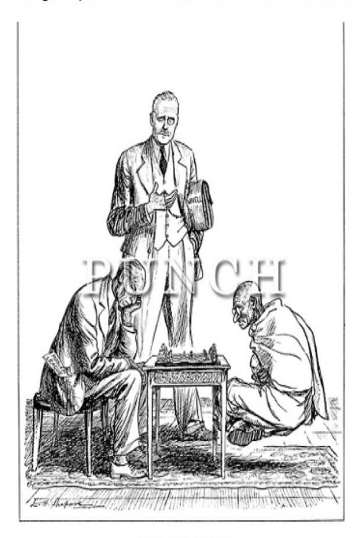
TIME FOR A MOVE

What does source B suggest about the attempts to solve the problems of the sub-continent in 1945?