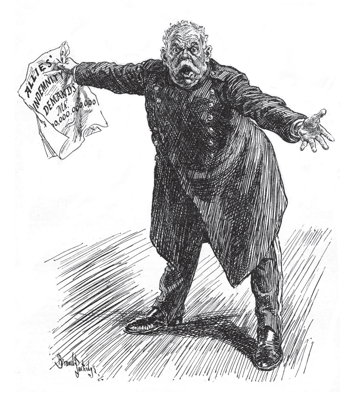
A British cartoon entitled 'The Reckoning', published in April 1919. Germany is saying, 'Monstrous, I call it. Why, it's fully a quarter of what we should have made them pay, if we'd won.' 'Indemnity demands' refers to the reparations.